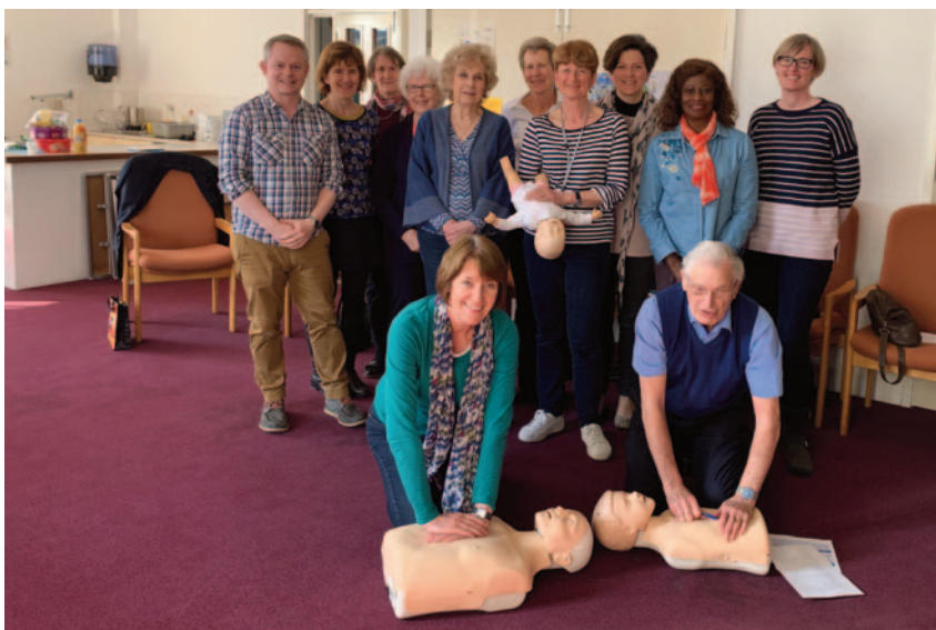
Annie (the first aid dummy) was OK! (thanks to our volunteers)