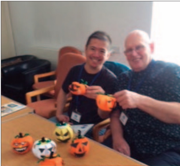
It's Spooky.....getting ready for Halloween