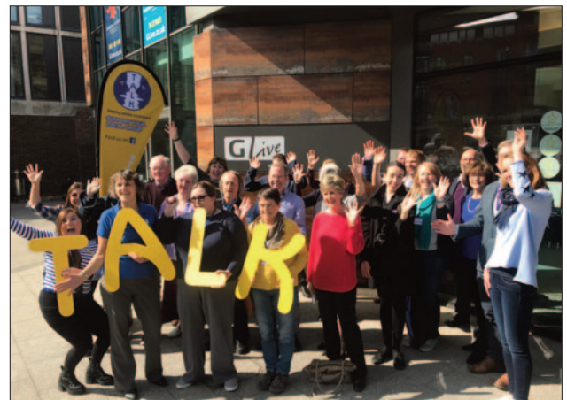
Launch day at G Live

Tesco Bags of Help – Knaphill Group St Peter's Relief in Sickness Fund Woking Borough Council Spelthorne Borough Council Guildford Borough Council Elmbridge Borough Council NHS Ashford & St Peter's Foundation Hospital Trust Surrey County Council Members Allocations Co-op Local Community Fund Ashford Group Guildford Poyle Charities