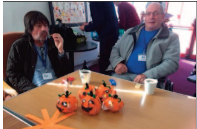
Pumpkins are complete