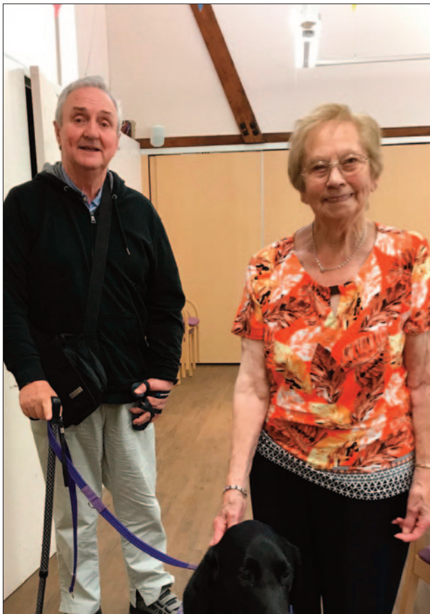
Where's my bone?