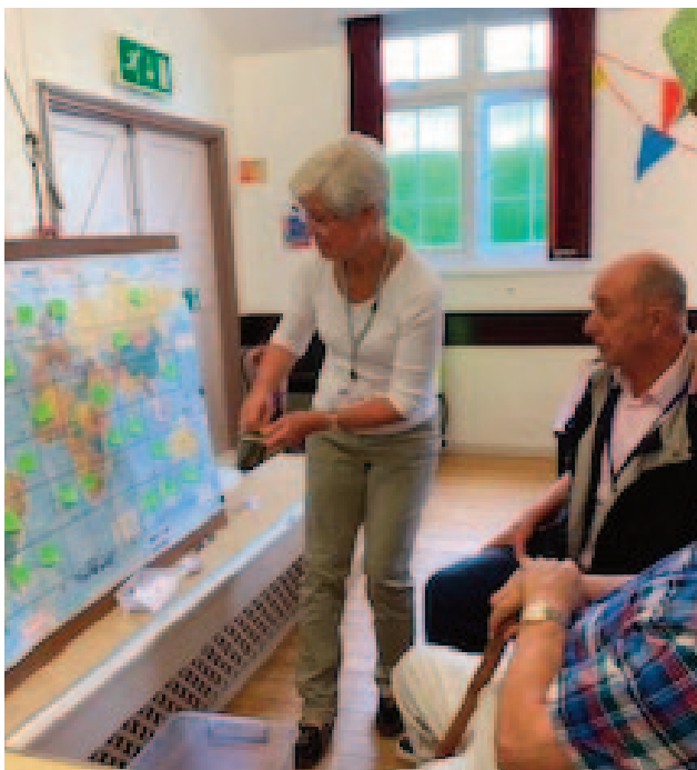
Round the World