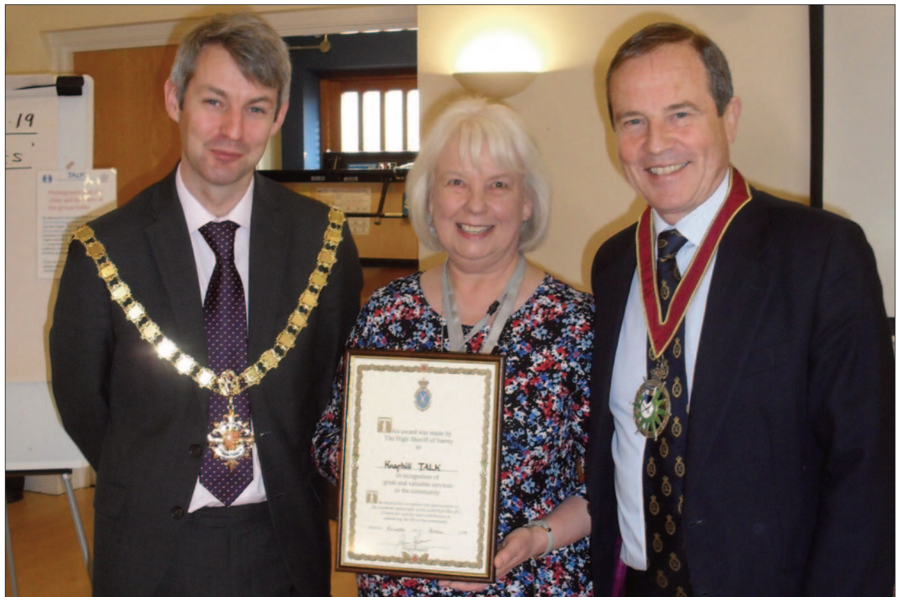
High Sheriff's Award