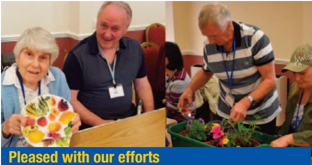
Pleased with our efforts

THRIVE Gardening charity came in to share some tips about growing flowers and vegetables with our recoverers, carers and volunteers at our Knaphill and Walton groups. They helped us to make some lovely pictures and to plant some flowers ready for Spring.