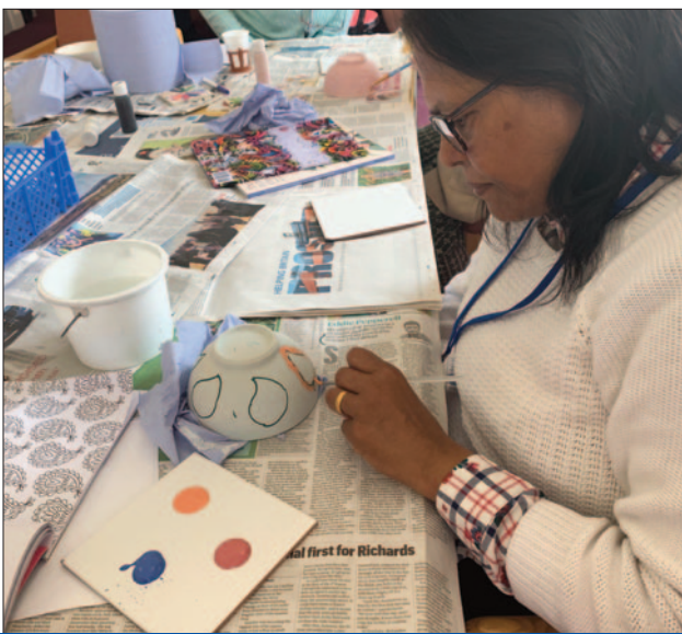
Our Ashford Group enjoyed painting pottery