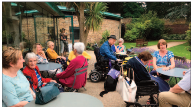
Enjoying the View