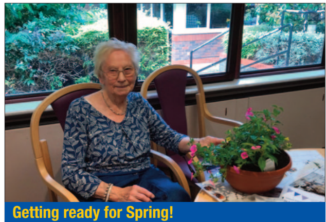
Getting ready for Spring!