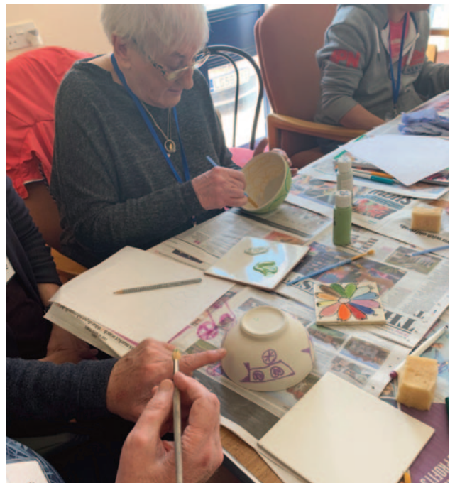
Paintbrushes at the ready!