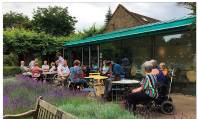
Lots of Lavender