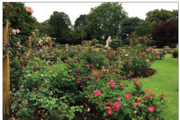
Beautiful garden visit