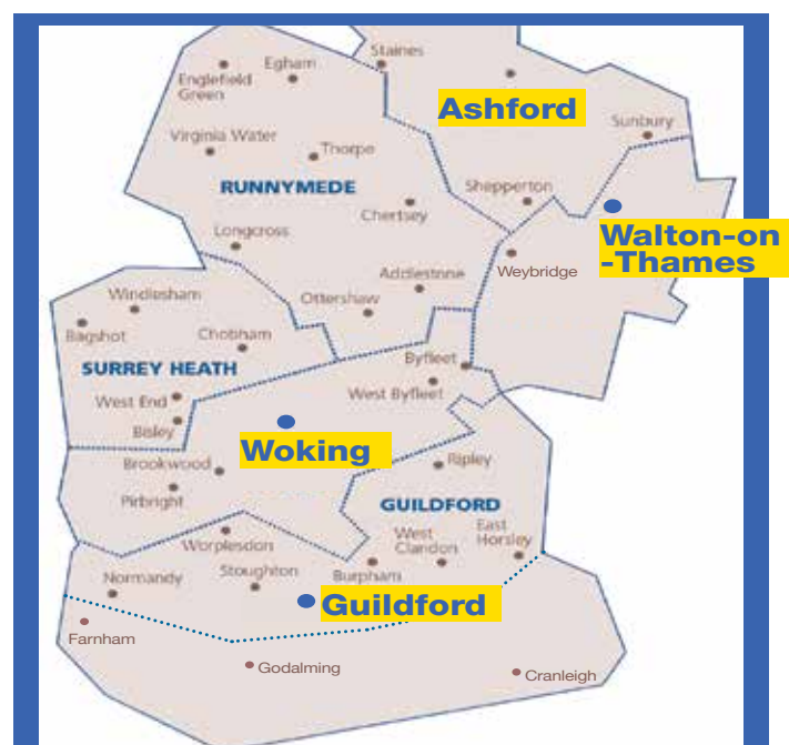
Our core catchment is shown on the map

We look forward to the results of this project later this year and continue to address the recommendations arising from the 2014 project.